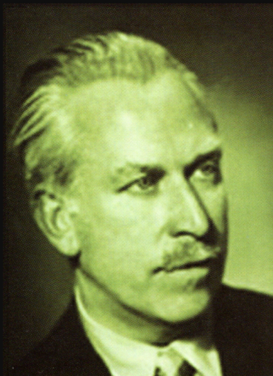
Sir Arthur Bliss