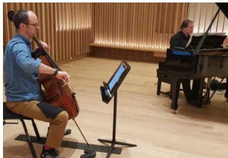
At the recording sessions, 2021 (socially distanced)